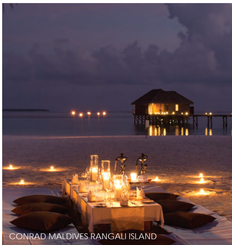
CONRAD MALDIVES RANGALI ISLAND