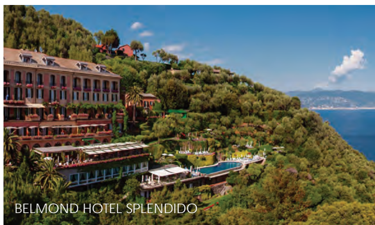
BELMOND HOTEL SPLENDIDO