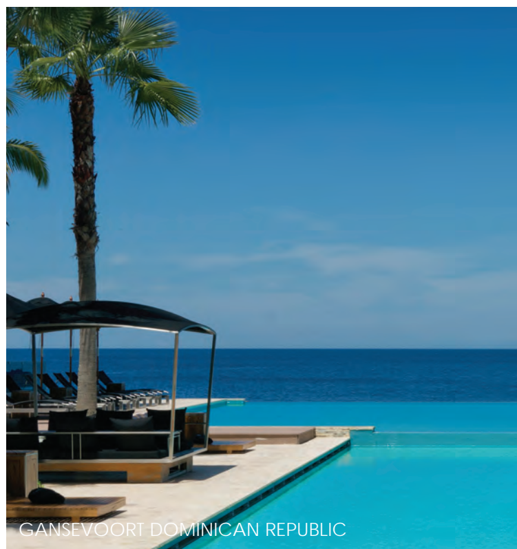
GANSEVOORT DOMINICAN REPUBLIC