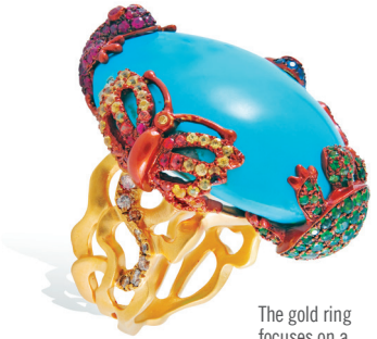
The gold ring focuses on a turquoise with a surround of brown diamonds, fancy sapphires and tsavorites.