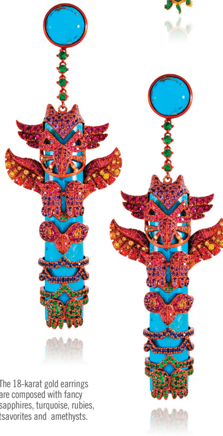
The 18-karat gold earrings are composed with fancy sapphires, turquoise, rubies, tsavorites and amethysts.