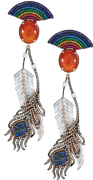
The gold feather earrings are studded with sunstones, fancy sapphires, white, black and brown diamonds and tsavorites.