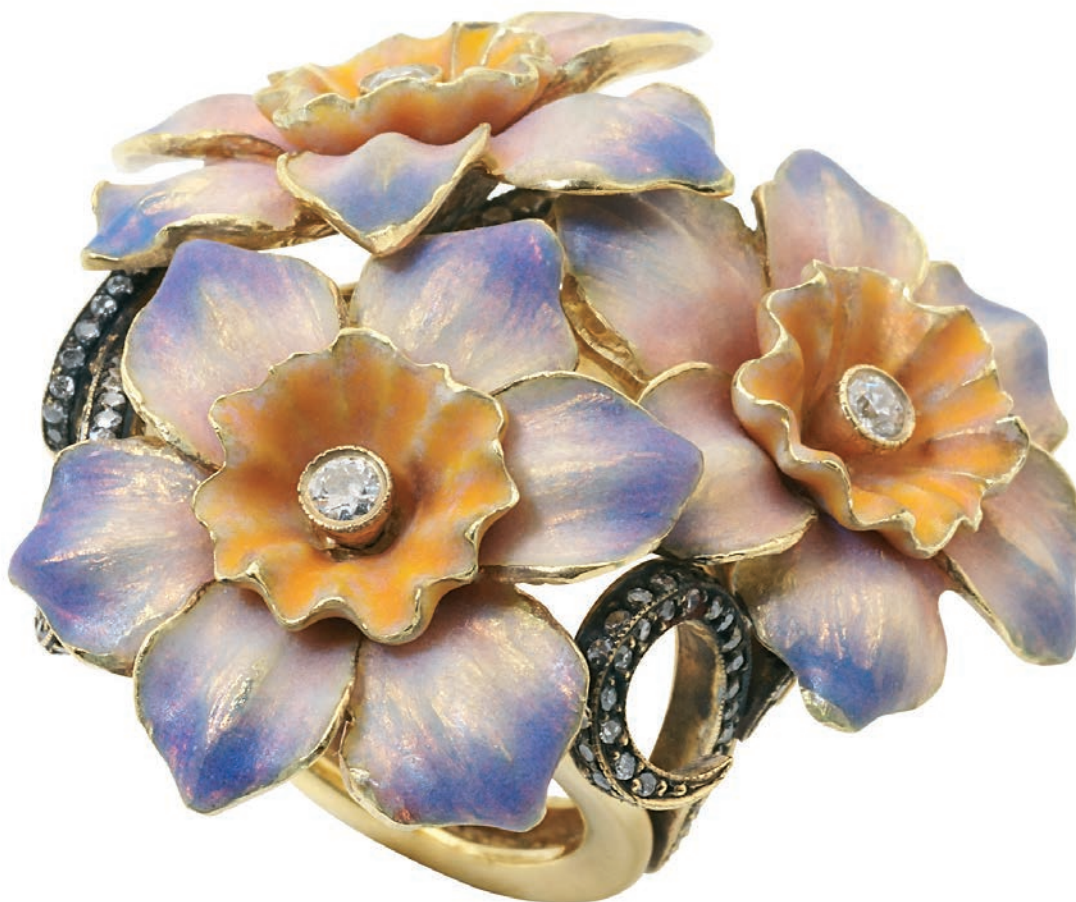
Enamelled 18-karat gold ring set with diamonds by A&W Mouzannar.