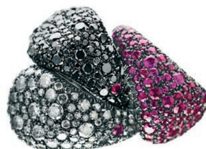
Meteor rings in gold set with black diamonds and rubies by Dori.