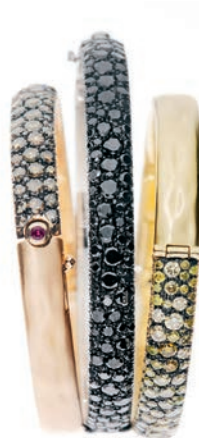
Gold meteor bangles by Dori.