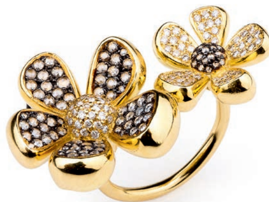
18-karat yellow gold Cherry flowers ring by Alia.