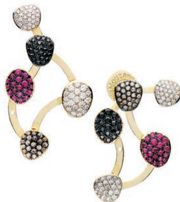
18-karat yellow gold earrings from the Modular collection feature white and black diamonds and rubies designed by Alia.