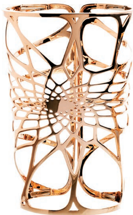
Pink and yellow gold Silene cuffs designed by Zaha Hadid for AWM.