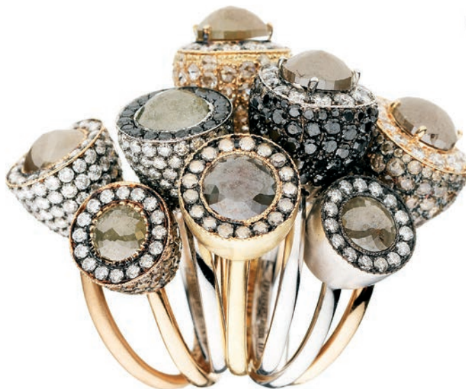
18-karat gold Galet rings set with an array of diamonds by Alia.