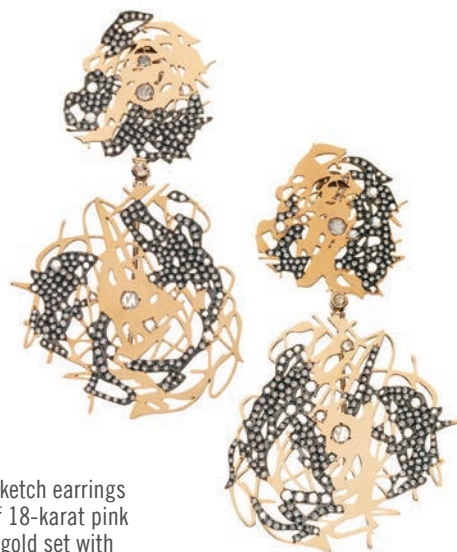
Sketch earrings of 18-karat pink gold set with diamonds by Alia.