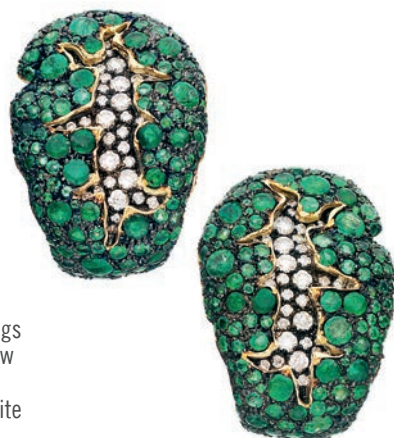
The Meteor earrings in 18-karat yellow gold set with emeralds and white diamonds by Dori.