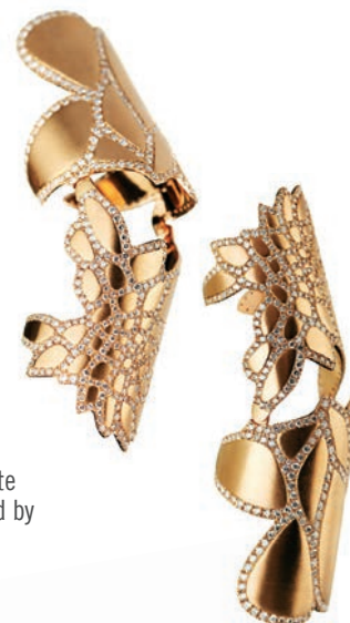
18-karat Silene brushed yellow gc ring set with white diamonds designed by Zaha Hadid for AWM.