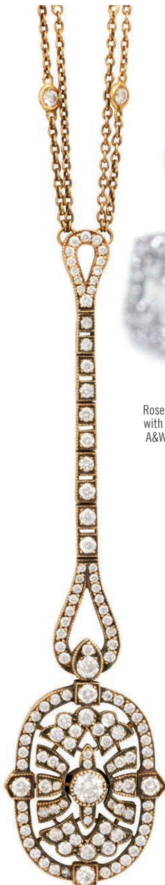
Gold and diamond pendant chain by A&W Mouzannar.