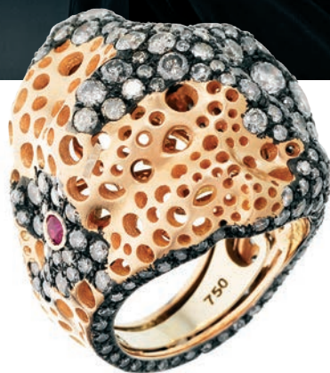
The 18-karat pink and oxidised gold ring is accented with diamonds by Dori.