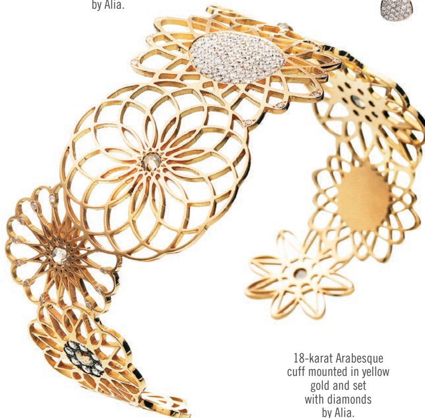
18-karat Arabesque cuff mounted in yellow gold and set with diamonds by Alia.