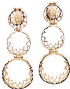
18-karat gold modular earrings from the Arabesque collection by Alia.