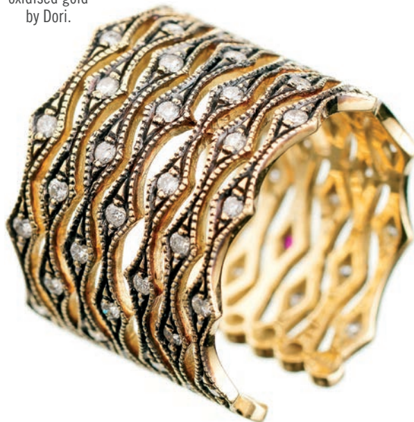
The Spine cuff in 18-karat yellow gold set with white diamonds on oxidised gold by Dori.