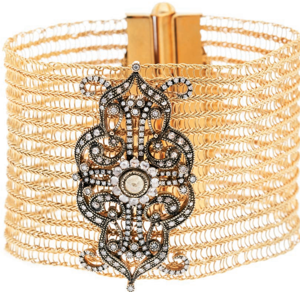
Bracelet crafted with antiquated gold set with diamonds by A&W Mouzannar.