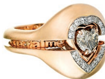
Gold Cache ring.