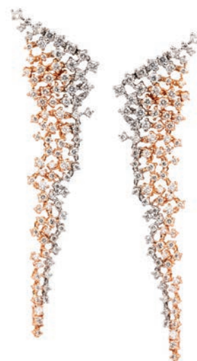
Asymmetrical diamond and gold earrings by A&W Mouzannar.