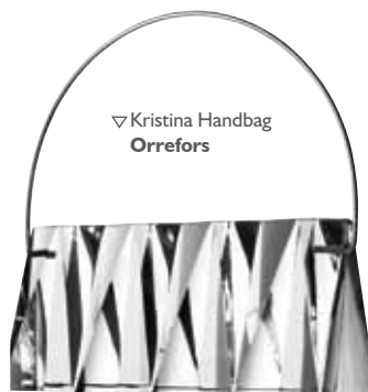
▽ Kristina Handbag Orrefors