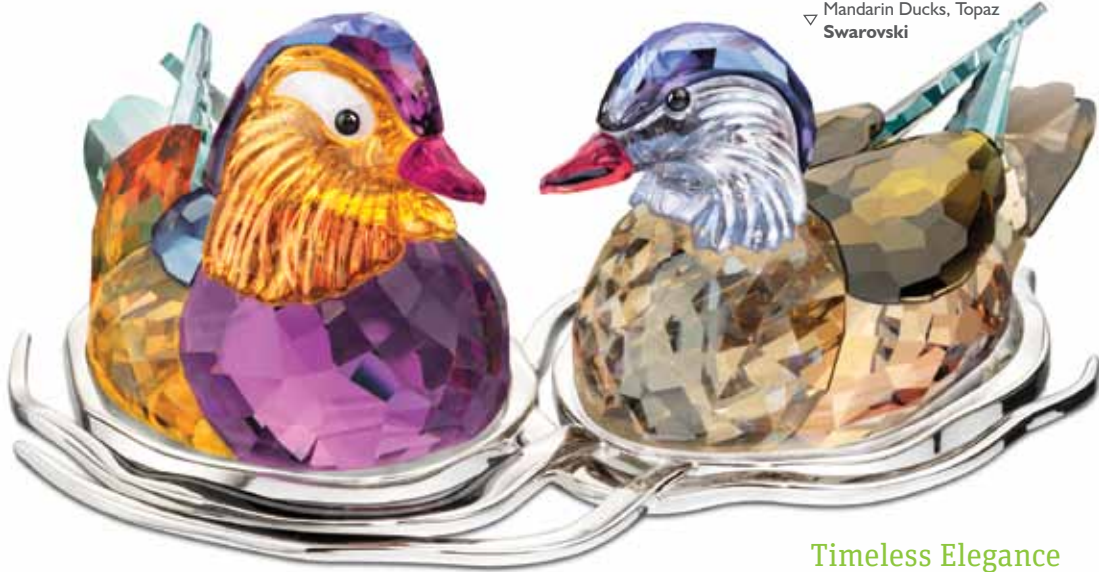
▽ Mandarin Ducks, Topaz Swarovski