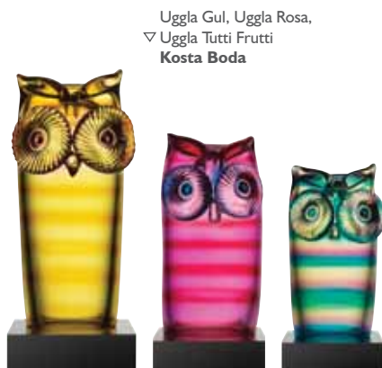
Uggle Gul, Uggle Rosa, ▽ Uggle Tutti Frutti Kosta Boda