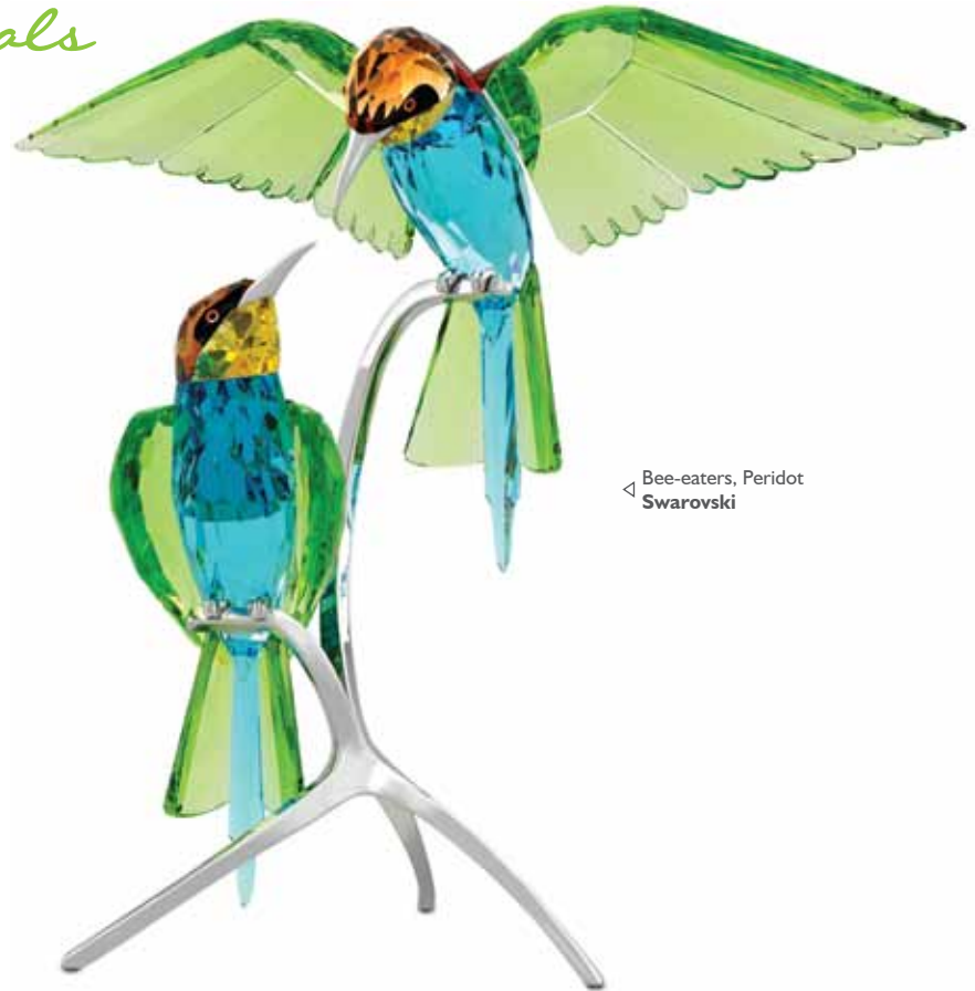
▽ Bee-eaters, Peridot Swarovski

Starting a crystal collection is easy. Visit the stores or look up the official websites of international brands; they offer myriad collectibles. See what you'd like to buy – perhaps you could start by collecting figurines on a specific theme like animals or musical instruments, or opt for the works of major artists who design for these brands. In fact, most of the coveted brands have exclusive clubs that offer members access to limited edition crystals, making it a great investment.