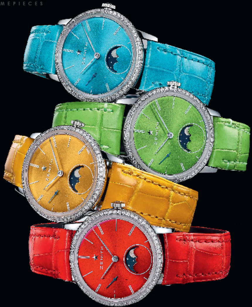
| By Smitha Sadanandan

THE COLOR OF TIME - Get ready to add another bright new addition to your watch collection with Zenith's Elite Lady Moonphase in fresh hues of yellow, apple green, red and turquoise that come with matching lacquered dials. The diamond-set bezel and dainty stainless steel case are contemporary and feminine, offering a bright new perspective on time. The mother-of-pearl dial is adorned with a star-studded deep blue moon disc with slender leaf-shaped hands, sweeping over stylized hour markers engraved on the dial. The Elite Lady Moonphase is fitted with color straps in alligator leather and has a protective rubber lining. Equipped with the automatic Elite Calibre 692, the timepiece has over 50-hours of power reserve. 'Tis time to dress up your wrist with color. www.zenith-watches.com