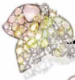
Double rose-cut yellow sapphires, brown quartz, purple spinels, tsavorites, chrysoberyls, white diamonds, 18k electroplated gold