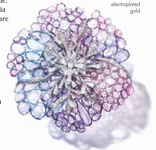
Double rose-cut aquamarines, tanzanites, purple spinels, pink spinels, purple sapphires, brilliant-cut Diamonds, white diamonds, 18k electroplated gold

"We recently moved to a new creative home: A new studio in the old French concession in Shanghai and I am devoting much of my time to finishing up the décor and adding artworks to my jewellery atelier." 🌸